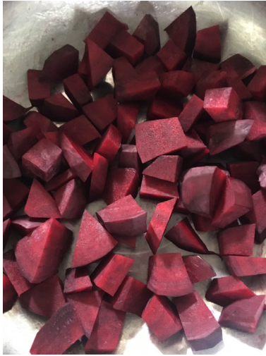
Figure 6. (a) beetroot cubes