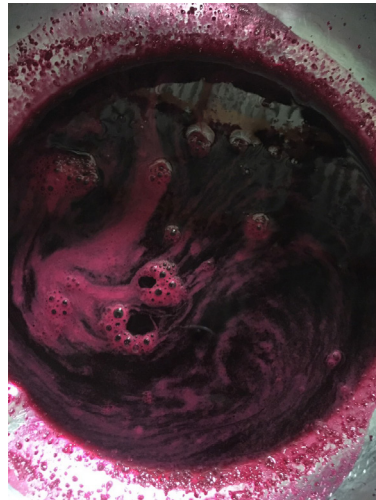
Figure 7. Beetroot juice