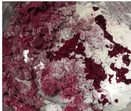
Figure 8 (c). Coloured beetroot honey added into flour to make a dough