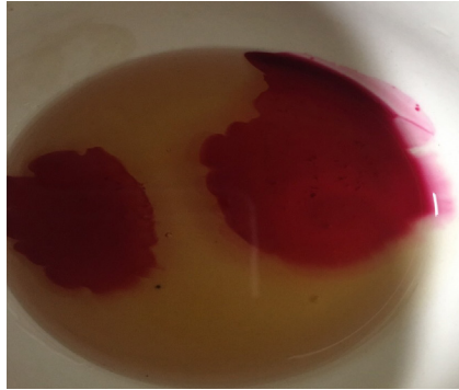
Figure 8 (a). Adding beetroot juice into coconut honey