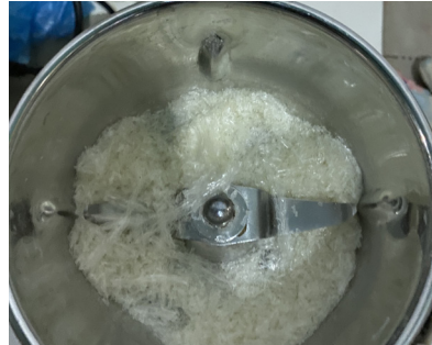
Figure 3 (b) blending agar-agar