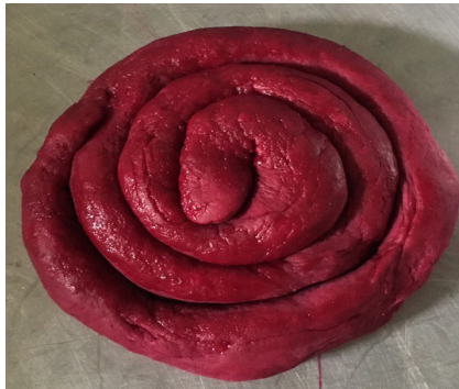
Figure 9 (b). Dough shaped into a spiral or shape of “Ulhaali”