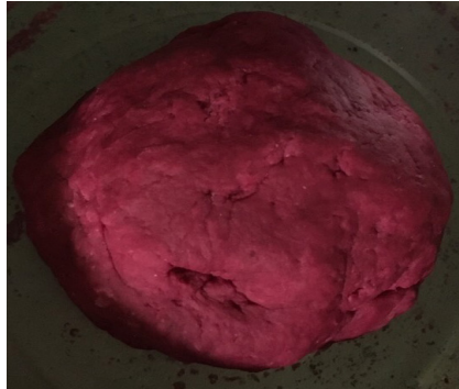
Figure 9 (a). Kneaded dough