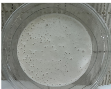
Figure 5. Cooked coconut mixture left to cool down