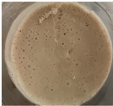
Figure 10. Ice cream after freezing