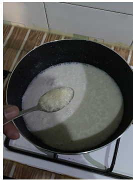
Figure 3 (c). adding agar-agar into the coconut milk