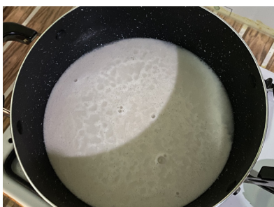
Figure 2. Cooking coconut milk with agar-agar