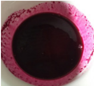
Figure 8 (b). Coloured beetroot coconut honey