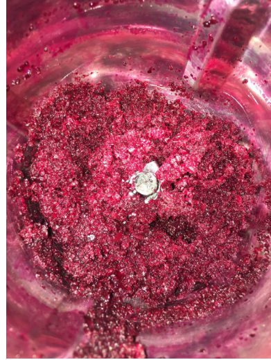
Figure 6. (b) ground beetroot