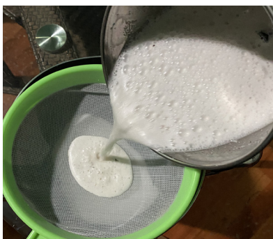
Figure 1. Coconut milk extraction

Coconut milk was extracted by mixing the coconut meat with water in a blender. The slurry was then pressed and filtered by using a sieve to remove the solid residue (Figure 1).