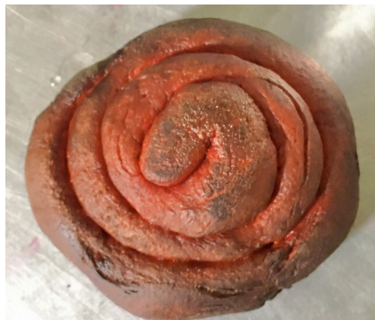
Figure 9 (c). Fried Ulhaali