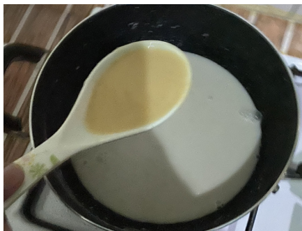
Figure 4. Adding condensed milk into the coconut milk mixture