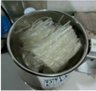
Figure 3 (a) agar-agar strips